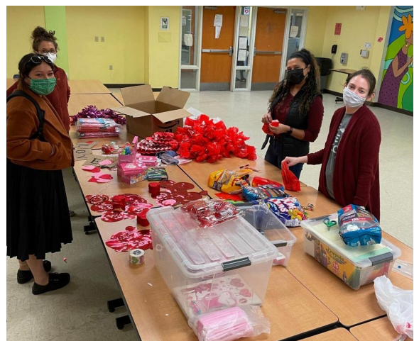
Top Image: Women's Dining Hall